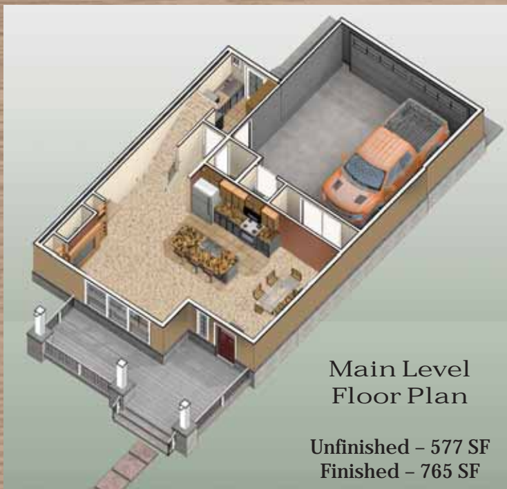
Main Level Floor Plan