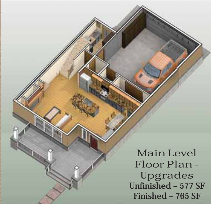
Main Level Floor Plan - Upgrades Unfinished - 577 SF Finished - 765 SF