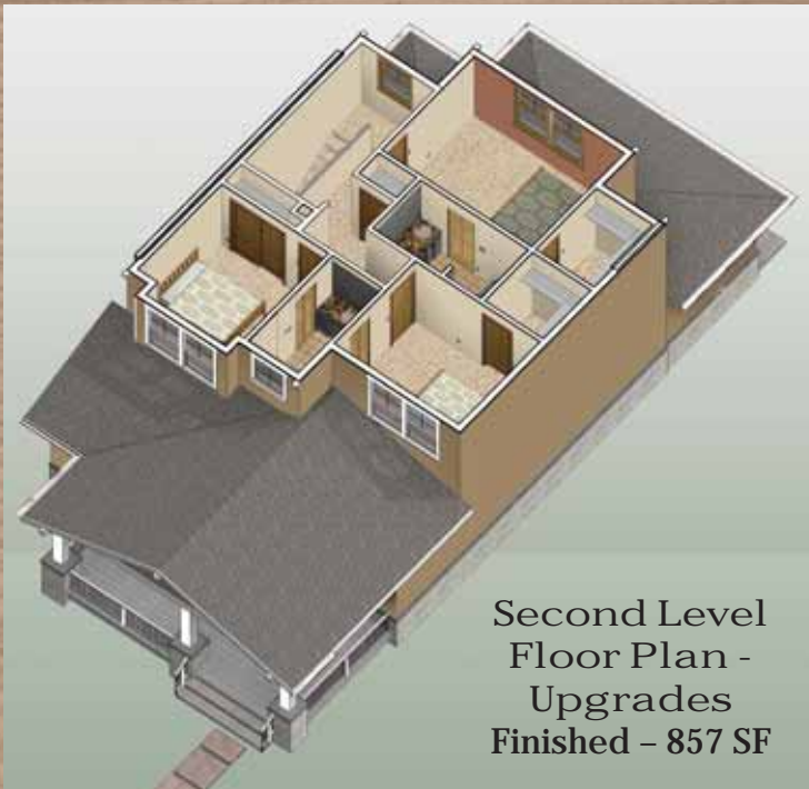
Second Level Floor Plan - Upgrades Finished - 857 SF